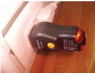
Fig. 1: Image shows standard check with "Receptacle tester" with the homeowner's Power bar plugged into the receptacle. The tester's red-light illuminates indicating receptacle is grounded.

The standard check that we all use with a Receptacle tester to see if a receptacle is grounded may present false readings if a power bar is installed at that receptacle . I recently observed in a number of houses that when some power bars are plugged into the receptacle being tested the tester will incorrectly present that circuit is grounded. See figures 1 & 2 below. For an explanation see footnote 1