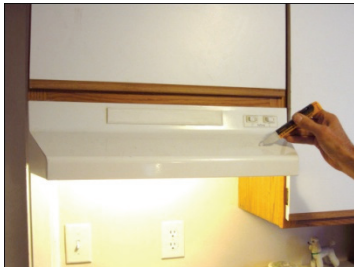
Fig. 1: Voltage sensor used to determine if exhaust fan is grounded. If sensor beeps, it is not grounded.

Conclusion: Without question, we must be looking for all indicators of handyman add-ons. The capacitive voltage sensor used to detect ungrounded appliances is a test that should definitely be included in a PowerCheck electrical examination.