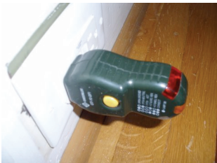
Fig. 2: Upon unplugging the Power bar the tester now correctly presents that the receptacle is not grounded.

Conclusion: When checking to see if a receptacle is grounded, any power bar plugged in that receptacle must first be unplugged.